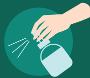
CLEAN & DISINFECT