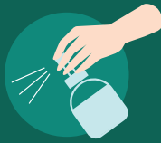
CLEAN & DISINFECT