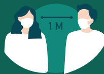
KEEP DISTANCE FROM OTHERS