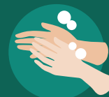
WASH YOUR HANDS FREQUENTLY