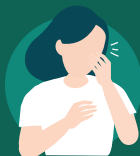
AVOID TOUCHING EYES, NOSE OR MOUTH