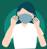
USE FACE MASK