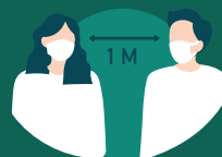
KEEP DISTANCE FROM OTHERS