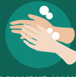
WASH YOUR HANDS FREQUENTLY